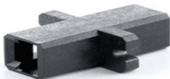
MT-RJ Standard Adapter