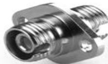
FC Oval Adapter, HD Style