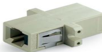
MT-RJ Adapter with SC Footprint