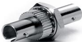
ST Adapter Simplex