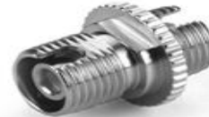
FC Round Adapter, D Style

FC fiber optic adapter are in various different shapes often with metal housing for square type, small D, oval, big D, rectangular versions are provided.