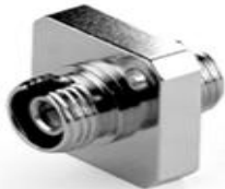
FC Square Adapter, Solid Body