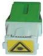
SC/APC with shutter