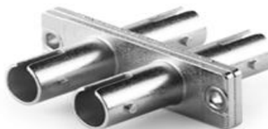
ST Adapter Duplex

ST Fiber Optic Adapters have simplex and duplex version mainly in metal. Plastic housing is for option.