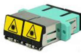
SC OM3 Duplex with shutter

SC fiber optic adapters have simplex and duplex in plastic or metal housing. One piece version and shutter version are available.